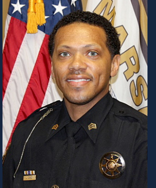
Promoted to Lieutenant