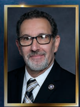
SAUL ALTER CIVIL RIGHTS / ANTICORRUPTION